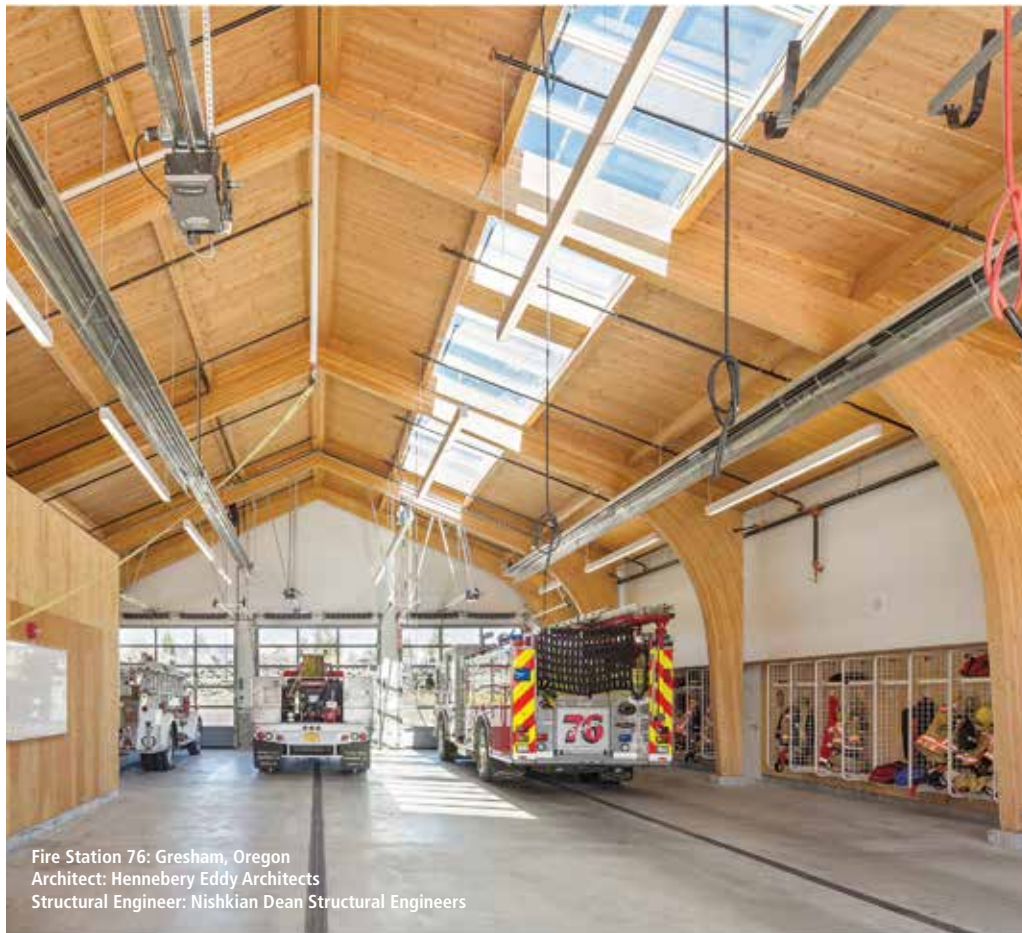
Fire Station 76: Gresham, Oregon Architect: Hennebery Eddy Architects Structural Engineer: Nishkian Dean Structural Engineers

Part of the structural system, the arches in this apparatus bay are designed to resist vertical and lateral loads required for essential facilities under the Oregon Structural Specialty Code. This project won a 2016 WoodWorks Wood Design Award.