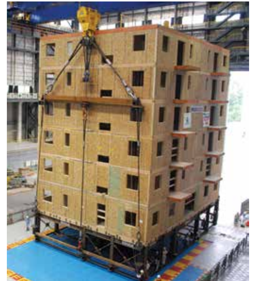
Subjected to three earthquakes on the world's largest shake table in Miki, Japan, this full-scale wood-frame apartment building performed excellently with little damage.

Structural wind-loading requirements are specified in Chapter 16 of the IBC and obtained