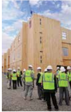
Made from CLT, the four-story Candlewood Suites Hotel at Redstone Arsenal, Alabama, had to meet Anti-Terrorism and Force Protection standards required for every structure built on a U.S. military base. Extensive engineering analysis was used to determine compliance with blast-resistance criteria.

Although adaptability from a resilience perspective most often means climate change adaptation, the fact that a wood structure is easily adapted with basic construction tools could contribute to faster recovery in the