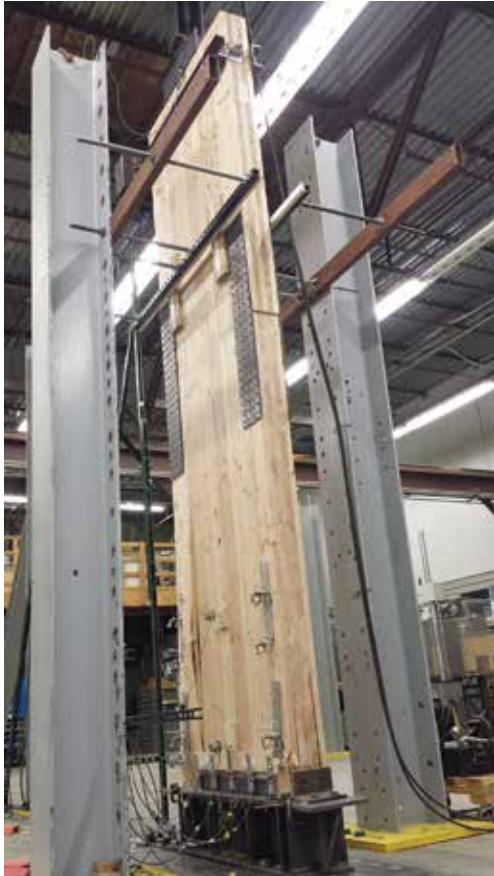
In this rocking test of a CLT shear wall, the panel maintained its lateral load-bearing strength under cycling loading to simulate seismic conditions and returned to a vertical position at completion of the test.

Highlighting wood's recognized performance as a structural material, FEMA P-320: Taking Shelter from the Storm: Building a Safe Room for Your Home or Small Business, includes information and design drawings for building wood-frame safe rooms.